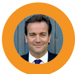
The Rt. Hon. Nick Hurd Chair, Impact Taskforce

We are an industry-led Taskforce that has been invited by the G7 Presidency to help answer a critical question for our time: “How can we accelerate the volume and effectiveness of private capital seeking to have a positive social and environmental impact?”